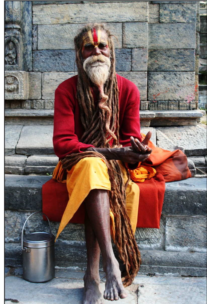
A Vaishnava sadhu in Kathmandu.