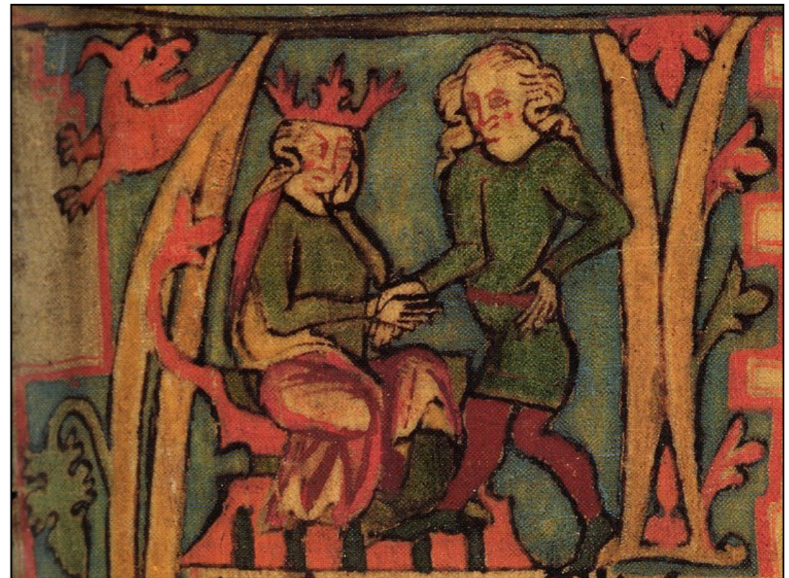
Harald Fair-Hair, in an illustration from the fourteenth-century Flateyjarbók.