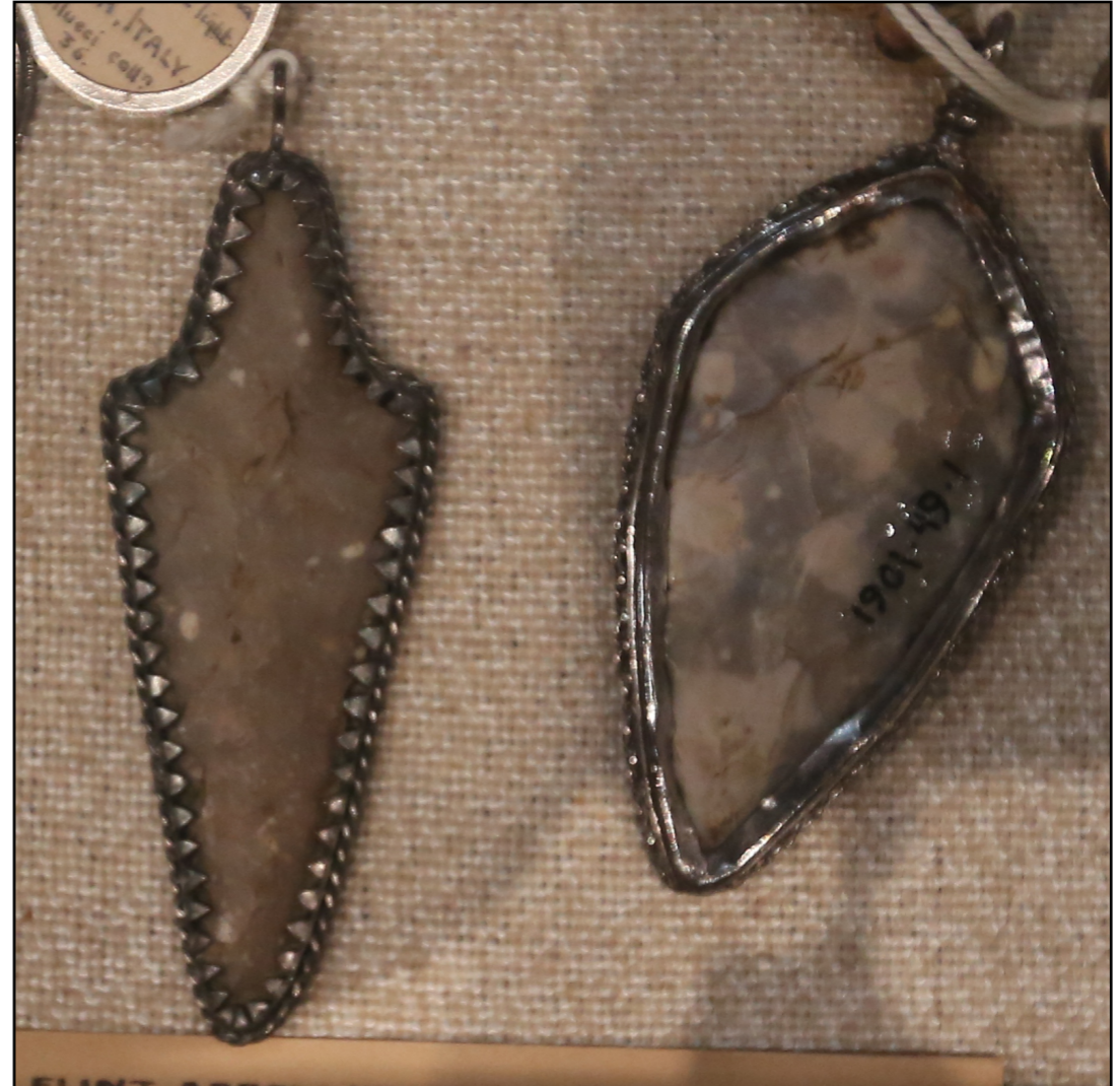
“Elf arrow” charms, set in silver