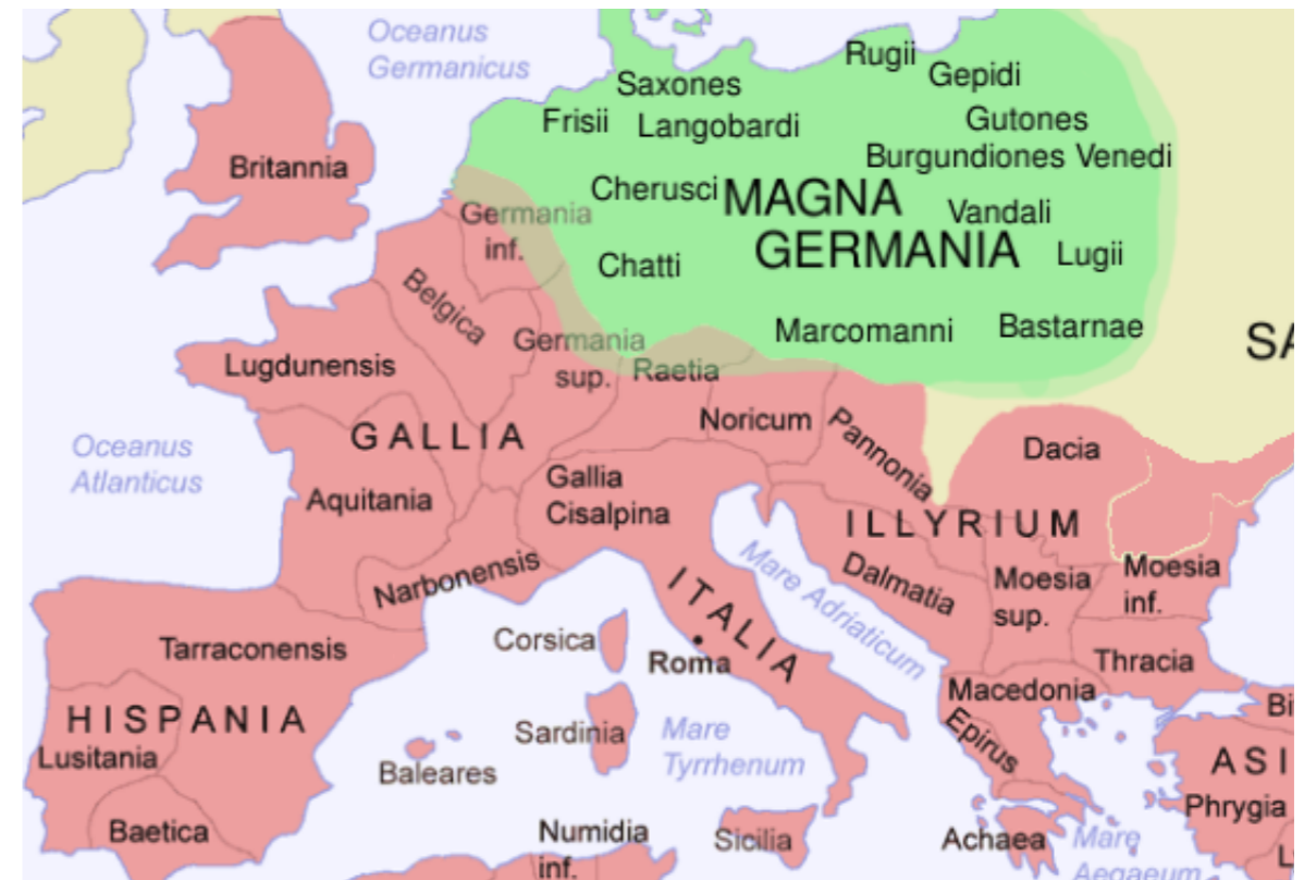
Map of the Roman Empire and Magna Germania in the early 2nd century

(By Modification · Bearbeitung · Prilaboro: D. Bachmann - File:Romia Imperio.png, originally by Jani Niememaa., CC BY-SA 3.0, https://commons.wikimedia.org/w/index.php?curid=1485399 )