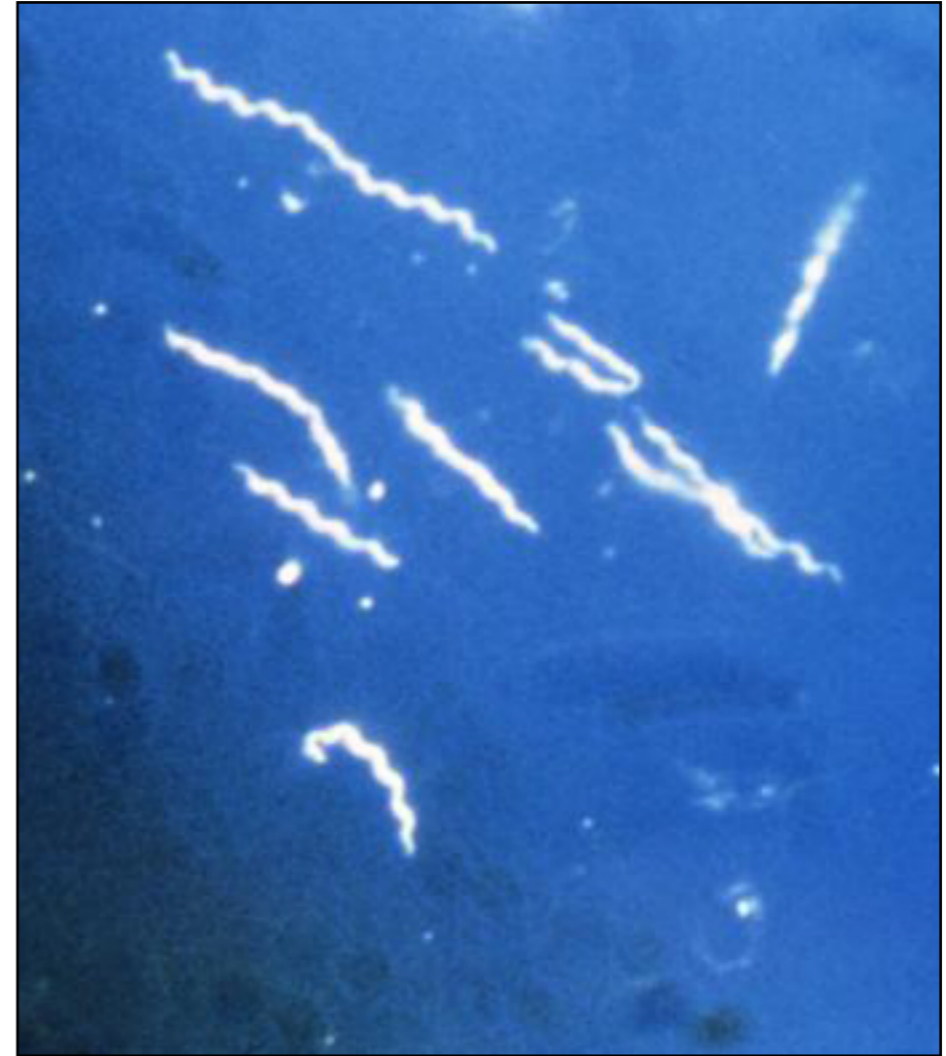
"Borrelia burgdorferi" the causative agent of Lyme disease (borreliosis) magnified 400 times