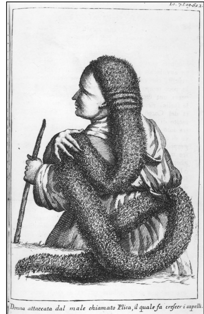
An example of a plica polonica, from between 1734-1766