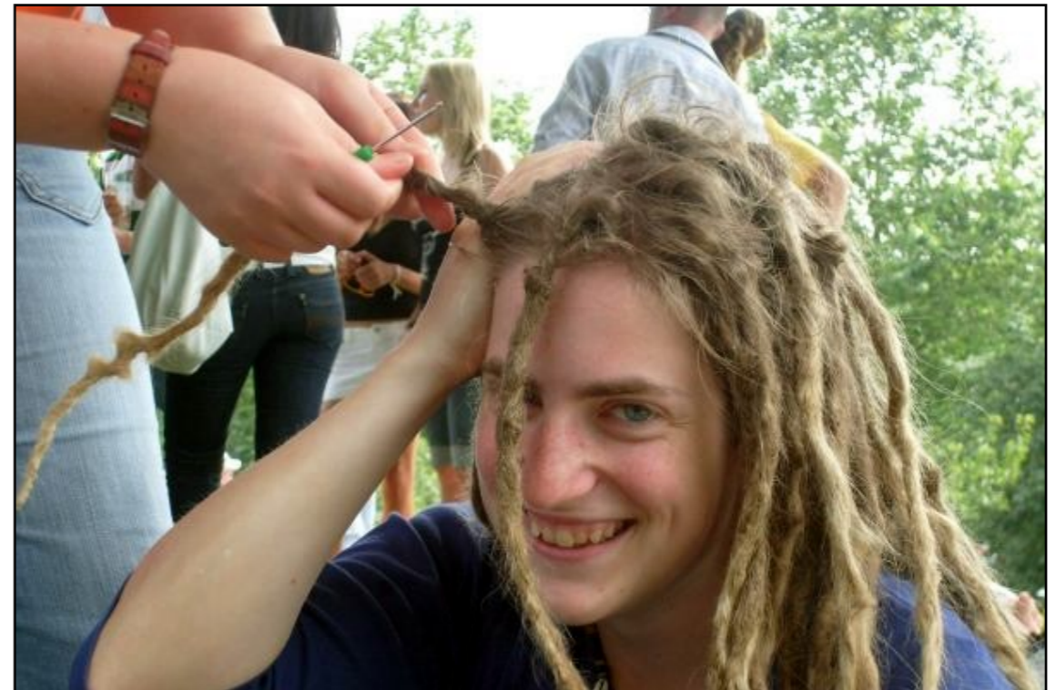
A matted hairstyle being maintained using a crochet hook.