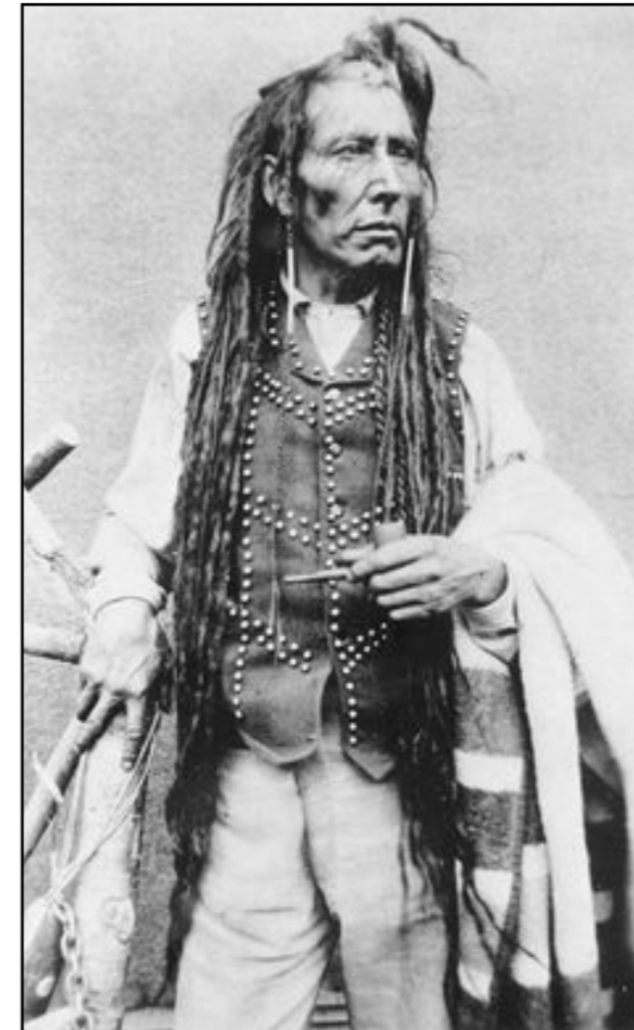
Cree chief Pitikwahanapiwiyin with locked hair, 1885. He was also known as Poundmaker; born in Rupert's Land, near present-day Battleford; the child of Sikakwayan, an Assiniboine medicine man, and a mixed-blood Cree woman, the sister of Chief Mistawasis